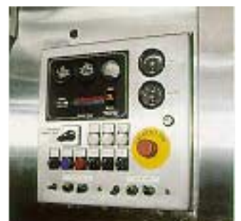
User friendly central control panel