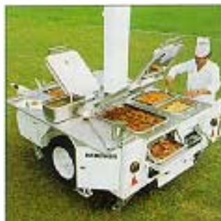
Modular Field Kitchen MFK Flexible kitchen for civil defense and disaster control organisations as well as for UN operations.