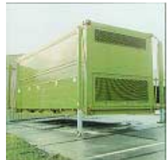
Containerized Kitchen CEK Future technology: containerized kitchens exclusive from Kärcher.