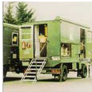
Shelter Kitchen EKÜ II The new generation of permanently mounted shelter kitchens from Kärcher for the German frontier guard.