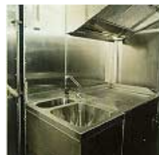
Double wash basin near US-Grill Plenty of storage space