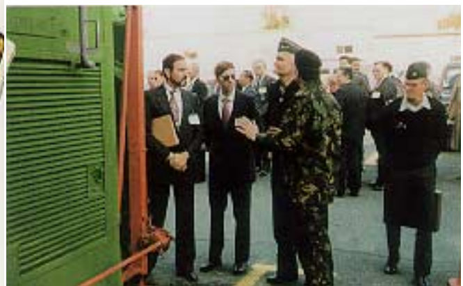
Inspection by a US-General and experts of the US army NATICK at the RD&E centre.