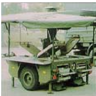
Tactical Field Kitchen TFK Proven throughout the world in armed forces operations.